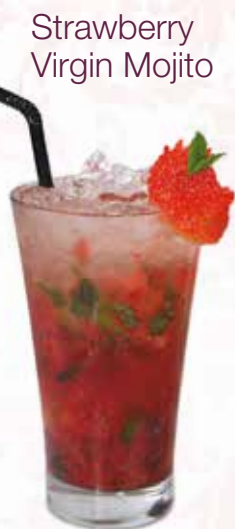
Strawberry Virgin Mojito